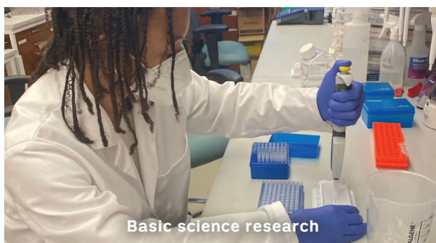
Basic science research