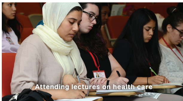
Attending lectures on health care